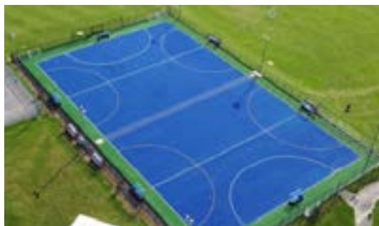
Example of a pitch installed at another school