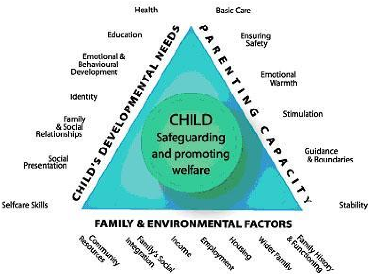
Figure 1 – The Assessment Framework 50