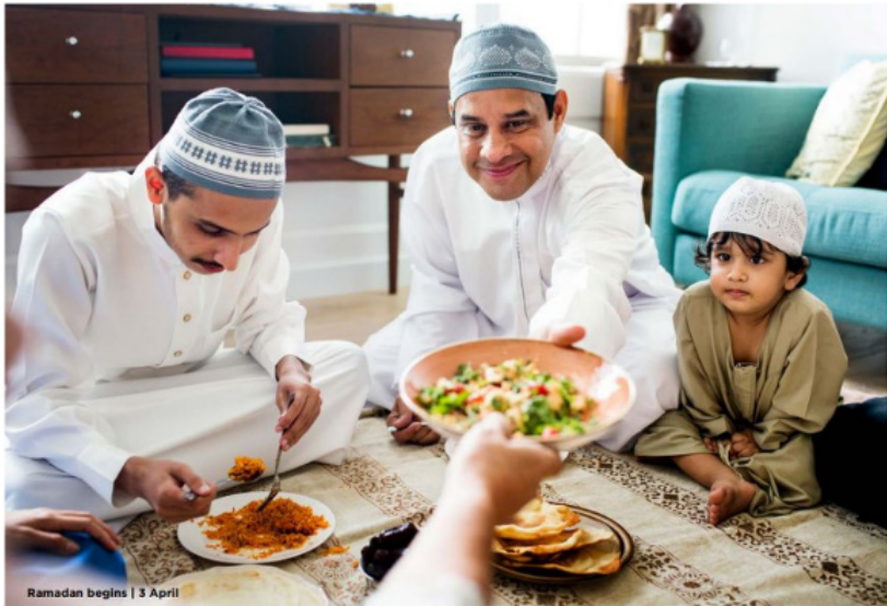
Ramadan begins | 3 April