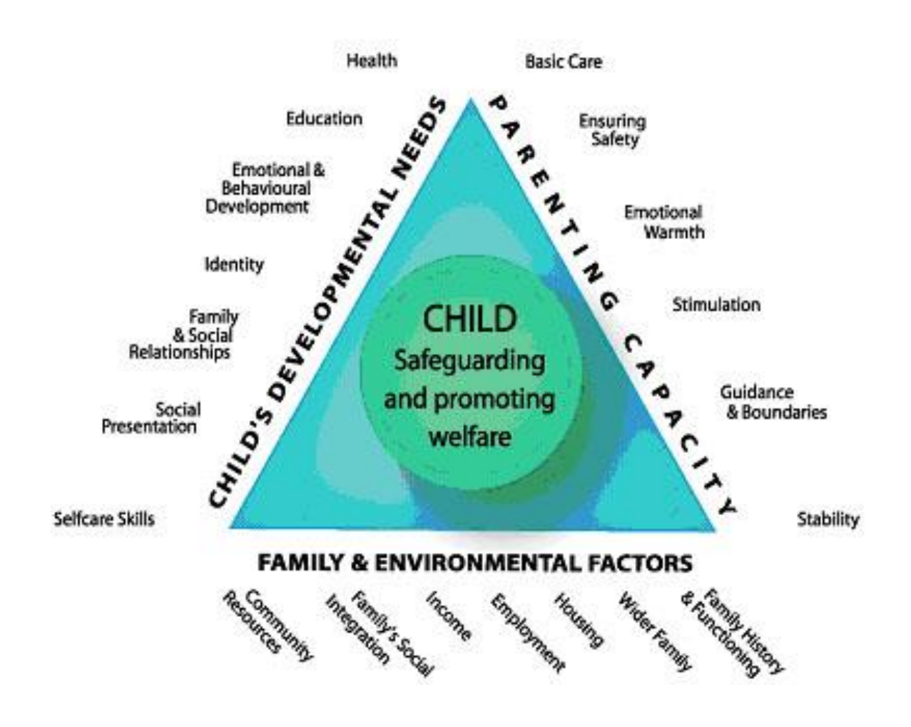
Figure 1 – The Assessment Framework<sup>48</sup>

<sup>47</sup> Children Act 1989 Part 3 section 17