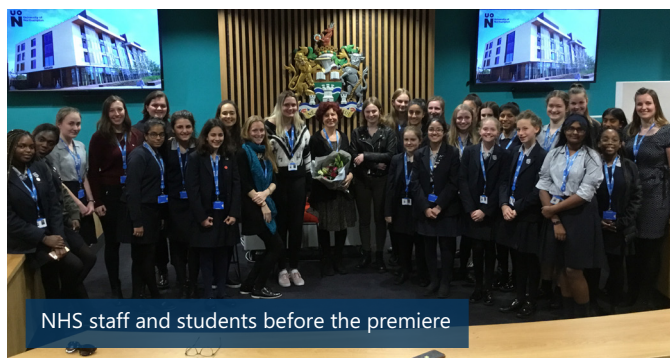
NHS staff and students before the premiere

Inspired by the life of legendary ballet stars Carlos Acosta