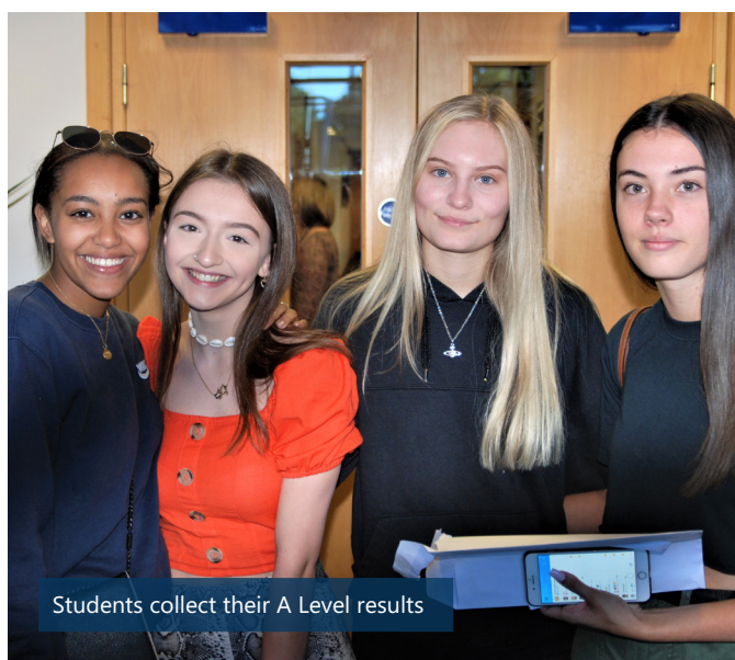
Students collect their A Level results

Once again, we were delighted to with students' excellent A Level results in the 2019 season. At a time when the media focus is on the human cost of the school league table system, we are proud that our 6.2 students, with the support and nurturing guidance of staff, coped superbly with the pressures of the examination system, with 50% of students achieving all A*-B grades and 24% earning three or more A*/A's.