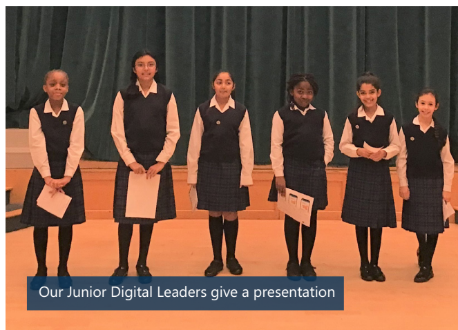
Our Junior Digital Leaders give a presentation

Supported by Facebook and the European Union, the programme also gives young people opportunities to engage with leading technology companies and have a say in creating a better internet for the future.