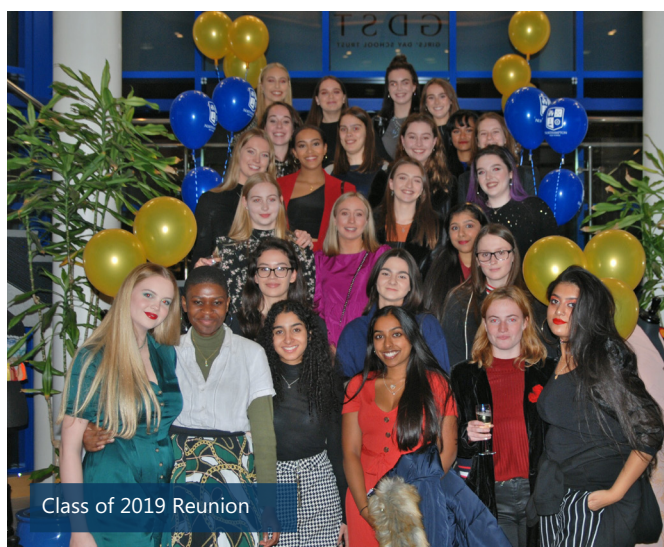
Class of 2019 Reunion

Opportunities for personal and intellectual growth in the classroom are a given at the High School, and the Awards Evening is a perfect opportunity to appreciate this as girls receive recognition for their public examination results, scholarship, and academic excellence and achievement. This year, we also celebrated the individual successes of a student who won a gold medal and a trip to a prestigious award ceremony in the Biology Olympiad and another who won a much-coveted place at the Newnham College Summer School for Mathematics in Cambridge. We considered, too, the two students who were selected for the English Schools Athletics Competition at Alexandra Stadium, the girl who won gold at the World Para Swimming European Championships and the former pupil who was nominated by the British Film Industry as one of 2019's 'faces to watch'.