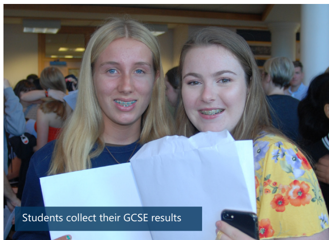
Students collect their GCSE results