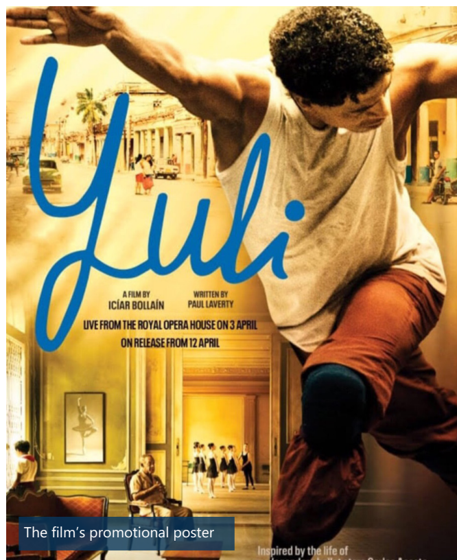
The film's promotional poster

Written by Paul Laverty (I, Daniel Blake), the film won best screenplay at the San Sebastian International Film Festival and received five nominations for the Spanish 'Goya' awards including Best New Actor for Carlos Acosta, Best Cinematography and Best Adapted Screenplay.