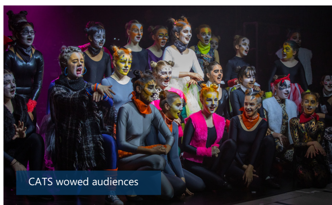
CATS wowed audiences

This year's theatre production, 'CATS', with a cast from both the Junior and Senior Schools, amazed audiences with their take on the Andrew Lloyd Webber spectacular, featuring the school orchestra (providing all musical accompaniment), dance, gymnastics, first-class singing and acting and even the Community Ladies' Choir.