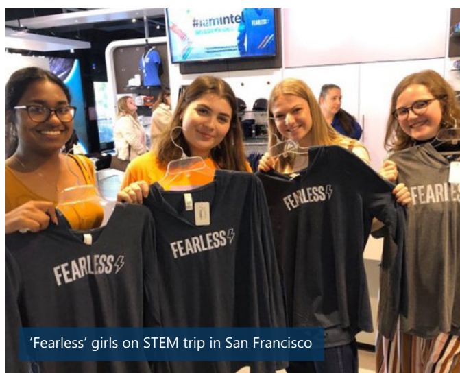
'Fearless' girls on STEM trip in San Francisco

Personal growth is not simply about solo recognition, though, and all of our students – including those mentioned above – understand the importance of bringing their peculiar skills and character to a group or team setting. The ability to think creatively and to work collaboratively are deemed as essential skills for future employment and lifelong learning and girls are encouraged in these, and in appreciating the value that they can add to a group.