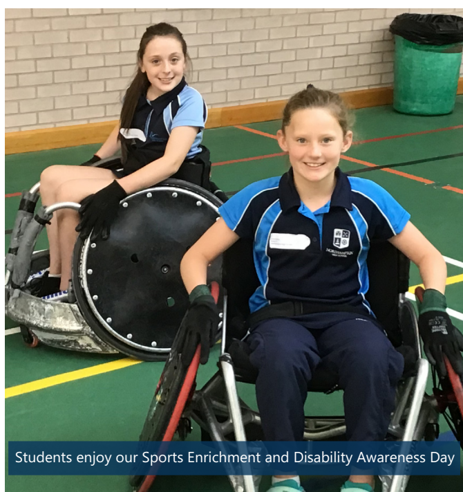
Students enjoy our Sports Enrichment and Disability Awareness Day

Our popular Sports Enrichment and Disability Awareness Day took place in July with six sporting activities (rugby, netball, hockey, tennis, athletics and swimming) with a swimming masterclass taught by our national standard swimmers. 13 local primary schools and 400 girls joined us, and the girls experienced a number of different sports with expert teaching and guidance, learning that sport is accessible to all.