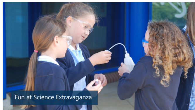
Fun at Science Extravaganza

In November, girls from a local academy joined us for our Sixth Form conference, #NowIsTheTime, designed to empower young women to start their working lives with the tools to advance their careers, gain equal pay and to progress without a ceiling. It featured an impressive panel of professionals from local businesses and universities. Noisy Classrooms, who had worked with our Junior School on a previous project, delivered a workshop on effective oracy and debating.