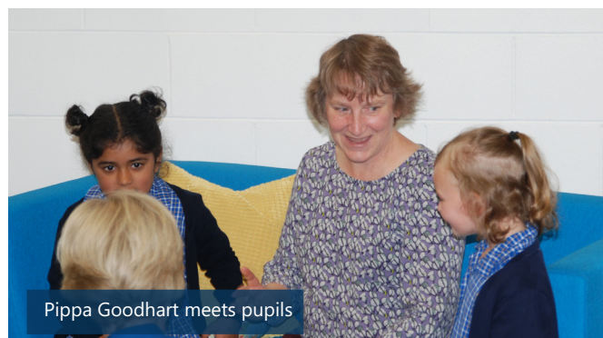
Pippa Goodhart meets pupils

The writers delighted in sharing their knowledge with enthusiastic audiences. Thought-provoking questions followed as students' imaginations were piqued by the wonderful world of creative writing and inventive story telling.