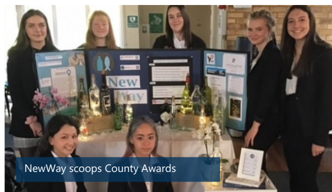
NewWay scoops County Awards

With their innovative and eco-friendly bottle lamps, NewWay broke boundaries and achieved new heights.