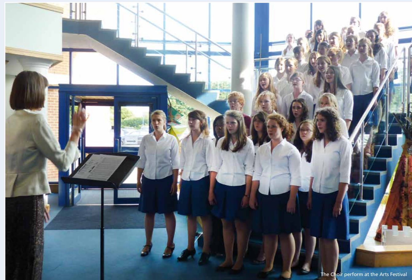
The Choir perform at the Arts Festival

The Arts Festival in June was amazing, with beautiful work on display in Art, Dance, Design and Technology, Drama and Music. In Art, outstanding creations included mixed media biography boxes and complex digital imagery utilising state