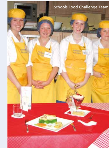
Schools Food Challenge Team

For the first time this year, the Business Studies department entered the Institute of Chartered Accountants for England and Wales' Business Enterprise Competition. From an original entry of over 170 schools, we were placed third in the national finals in Birmingham in July.