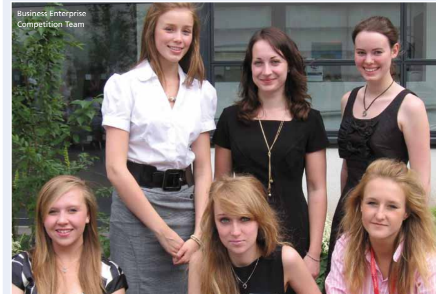
Business Enterprise Competition Team