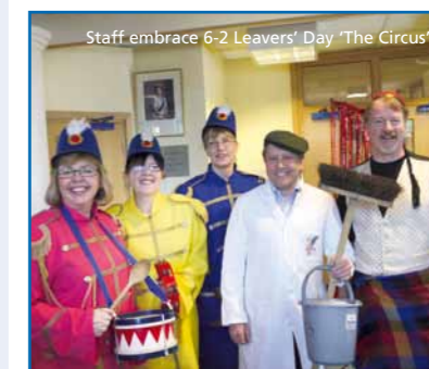
Staff embrace 6-2 Leavers' Day 'The Circus'

Assembly provides a lively stage and an alert and attentive audience for many girls